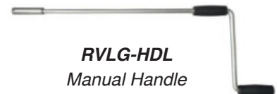
RVLG-HDL Manual Handle