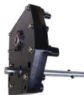
RVLG-RDBOX 3:1 Reduction Gear Box