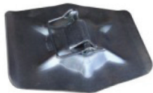
RVLG-DFT Durable Zinc Foot Pad