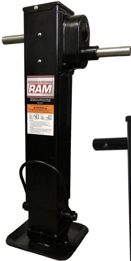
2 speed jack