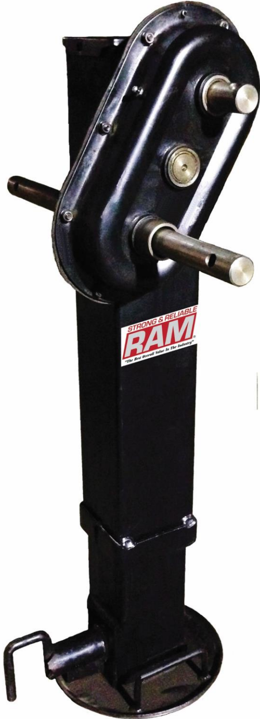
2 speed jack

Ideal for use with commercial, construction, larger utility and many other types of trailers where heavy duty lifting is needed.