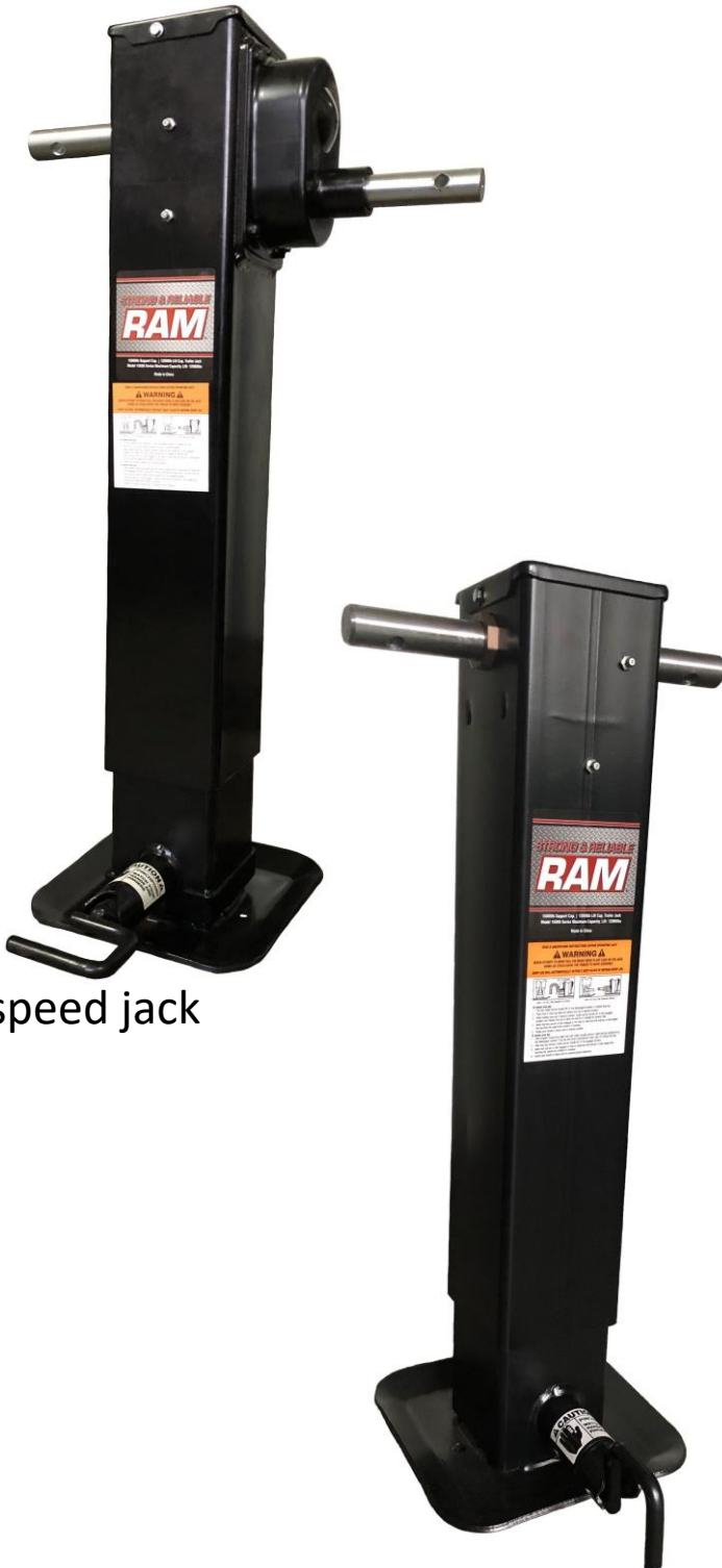
2 speed jack