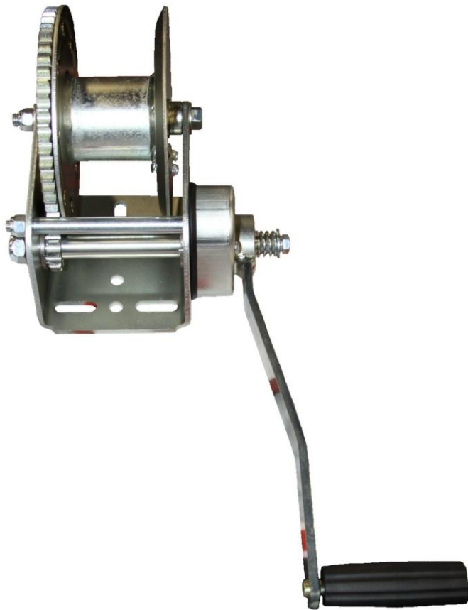
BW-1500 Single Handle