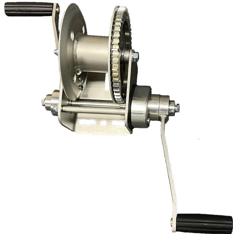
BWDH-1500 Dual Handle

Pacific Rim International, LLC 19120 SE 34 th Street., Suite 105 Vancouver, WA 98683 Phone: 360-859-3828