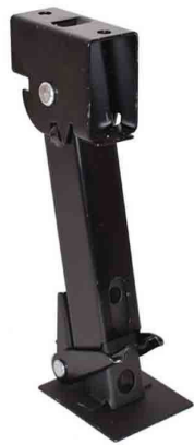
Flip Down Jack