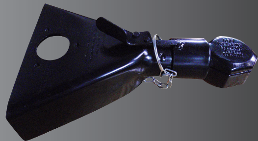
Cast Head A-Frame Couplers