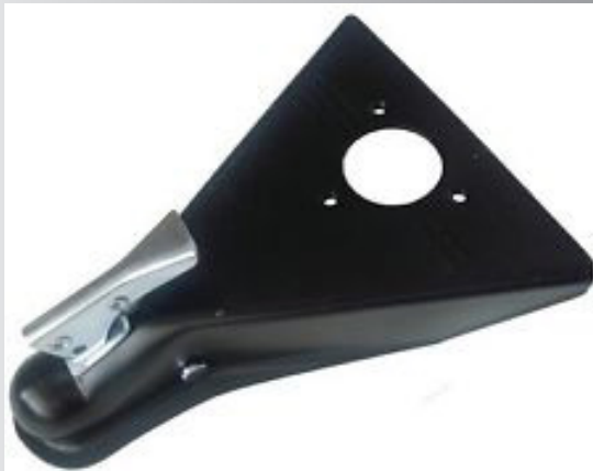
Stamped A-Frame Couplers