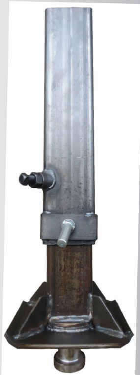
30K Square Tube

KP5G-R25 25K ROUND TUBE KING PIN GOOSENECK