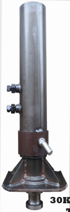
30K Round Tube

KING PIN GOOSENECK COUPLERS design features king pin head welded to gooseneck inner tube for added strength