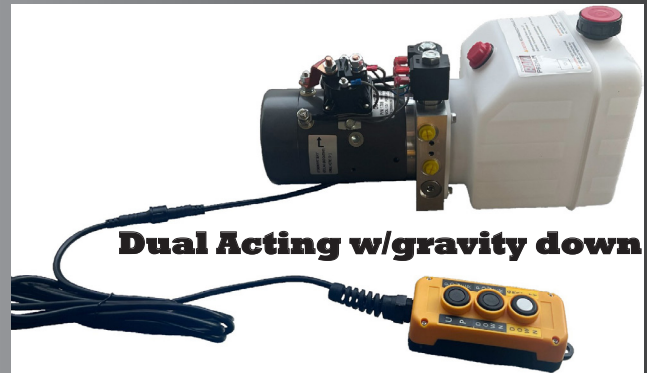
Dual Acting w/gravity down