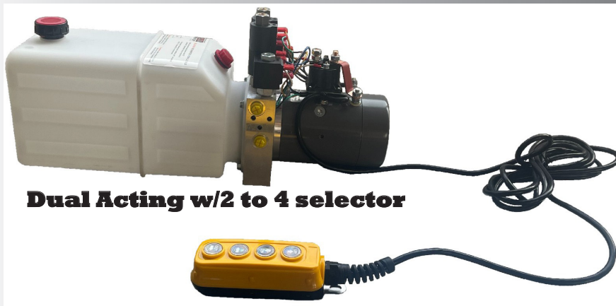
Dual Acting w/2 to 4 selector