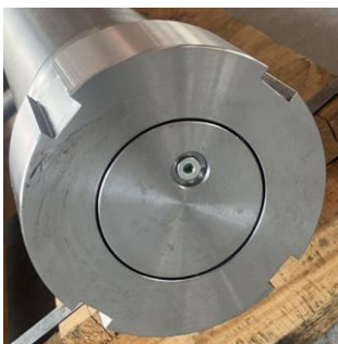
Telescopic Cylinder End w/bleed plug