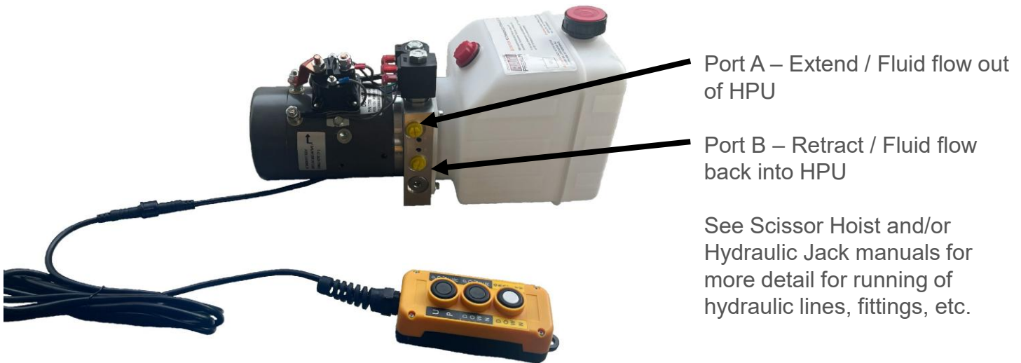
Port A – Extend / Fluid flow out of HPU