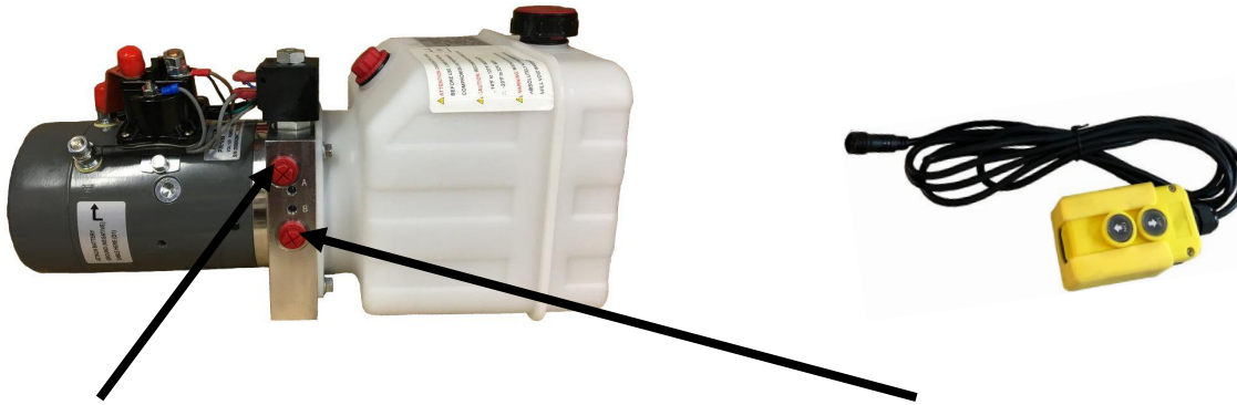
Port A – Extend / Fluid flow out of HPU

One HPU to operate both scissor hoist and two 15K hydraulic jacks use a six quart reservoir model or greater.